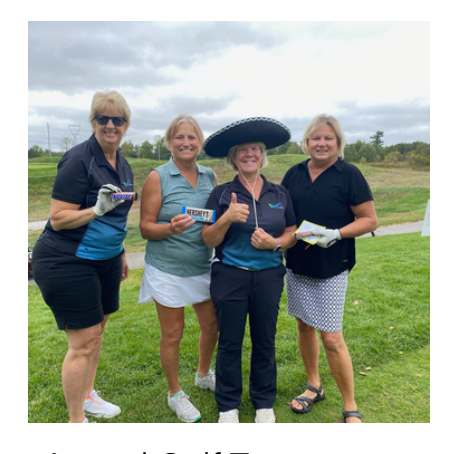
Annual Golf Tournament