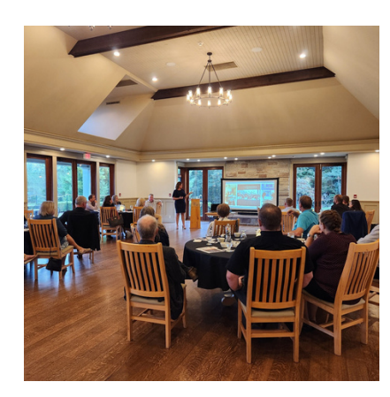
General Members Meeting