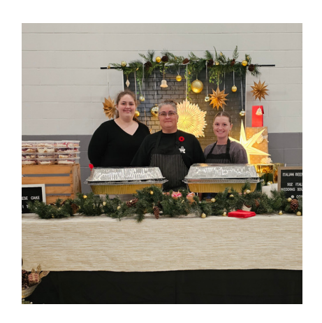
Taste of Norwich